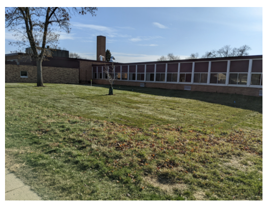
Central – Exterior signage installed. Exterior façade repaired.